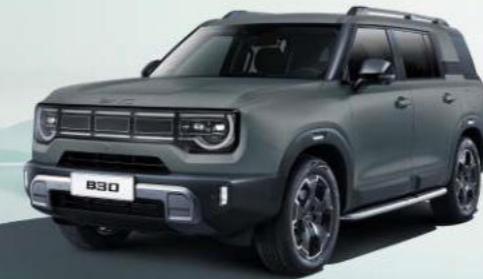
MATTE PLATINUM GREY