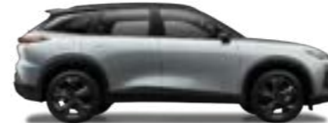
LIGHT GREY/BLACK ROOF