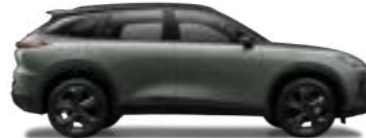
DARK GREY/BLACK ROOF